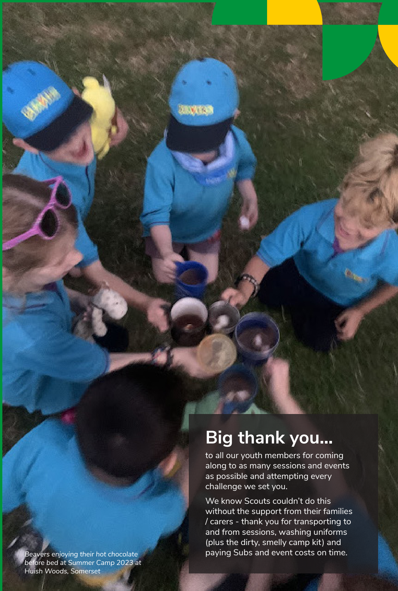
Beavers enjoying their hot chocolate before bed at Summer Camp 2023 at Huish Woods, Somerset